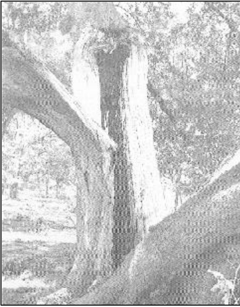
Figure 2. An example of structural failure of a tree with a termite-infested void.

cm) and then at a height of 30.5 cm on three other sides (labeled as north, west, south, and east). A Digital microProbe (DmP) was used for drilling (Sibert Technology Limited, Guildford, England). The DmP had a 500 mm by 1.5 mm diam. probe (bit) that would penetrate up to 350 mm into the trunk of a tree. Distance, probe rotations, and force are measured every 0.1 mm and transmitted in ASCII format to a computer via an RS-232 serial connector. Software supplied with the DmP creates graphs of the raw data, using Microsoft Excel, presenting graphs of the relative hardness of the wood drilled (Figure 3). R = radius from the center of the gallery to the surface of the tree and t = thickness of the healthy remaining wall were obtained from the graphs. When t/R < 0.35 , a tree is considered a candidate for structural failure (Mattheck and Breloer, 1994). The percent of a tree that was hollowed was estimated by averaging the percent wood removed at each of the 4 samples taken at a height of 30.5 mm. Termites were identified to species using soldier keys (Scheffrahn and Su, 1994).